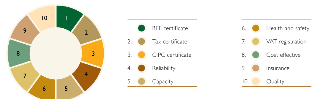
Figure 1: Requirements to meet procurement supply needs

There are 10 statutory requirements outlined by large enterprises across all three Sub-Sectors as prerequisites for potential suppliers. These requirements are listed in Figure 1.