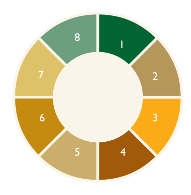
Figure 3: Challenges faced by LEs when procuring from EMEs

Below is a list of challenges outlined by large entities as impediments when outsourcing goods and services from small enterprises (see Figure 3). It is critically important for small black-owned suppliers that are intending to supply goods and services to large entities in the tourism sector to note these challenges and make improvements.