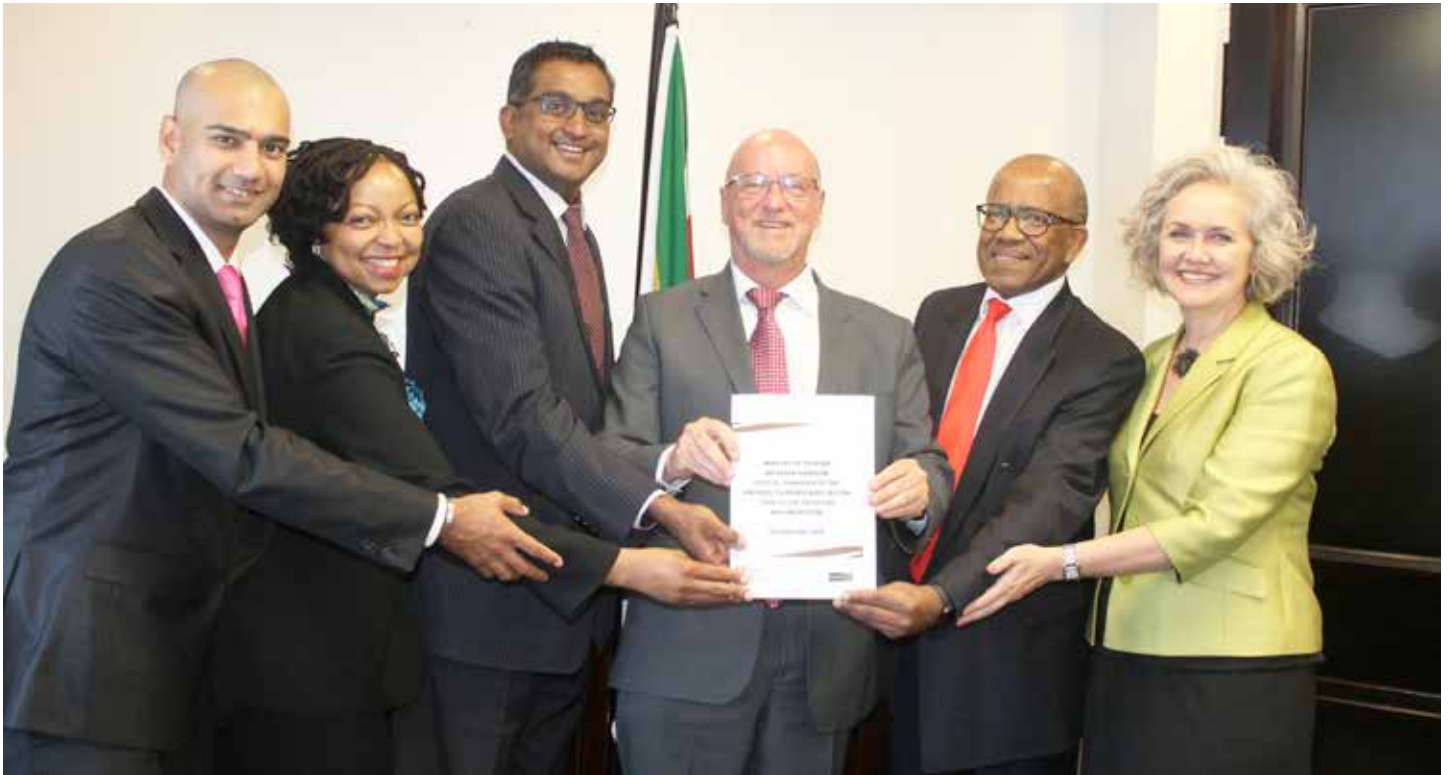
Official handover of the Amended Tourism B-BBEE Sector Code by the Minister of Tourism, Derek Hanekom, to the Tourism Business Council of South Africa (TBCSA) represented by Mr. Ravi Nadasen on the 9th February 2016.