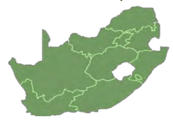
4.1 million trips -14.9% decrease from Q2: 2017