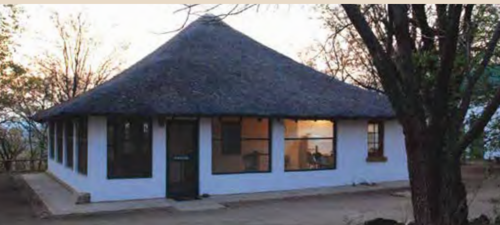
Mockford cottage at sunrise