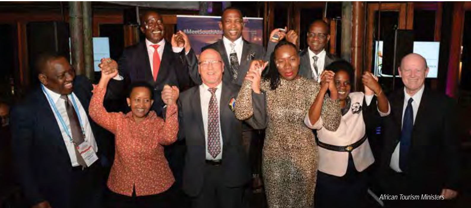
African Tourism Ministers