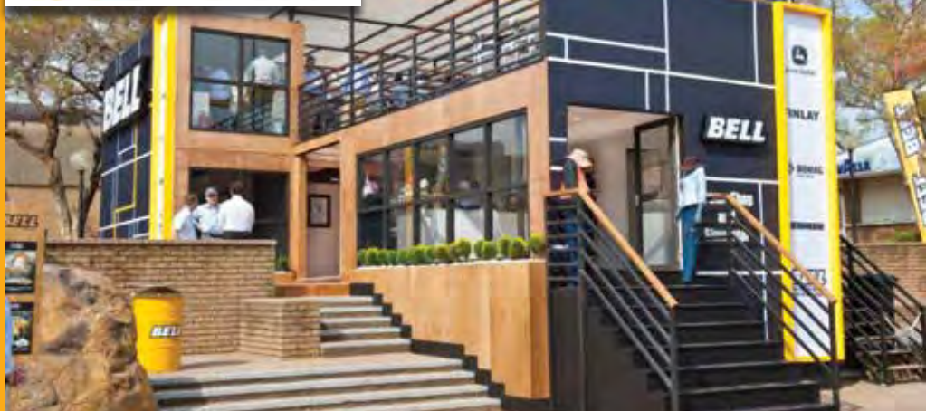
Award Winning Exhibition Stand built by Projects at Bauma Africa

“Exhibitions accelerate your marketing profile as it puts you face-to-face with top buyers who might not have been possible clients, or clients you would have struggled to organise an appointment with”