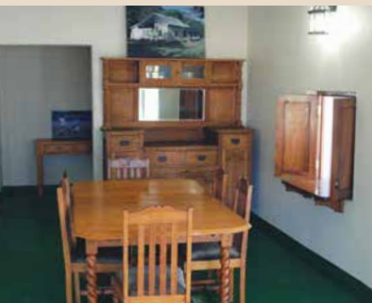
Mockford house dining room

The accommodation consists of three historic houses that were tastefully converted to guest accommodation. All accommodation has a fully equipped kitchenette, dining area, spacious patio which serves as a lounge, outside braai facility and ceiling fans (no air-conditioning).