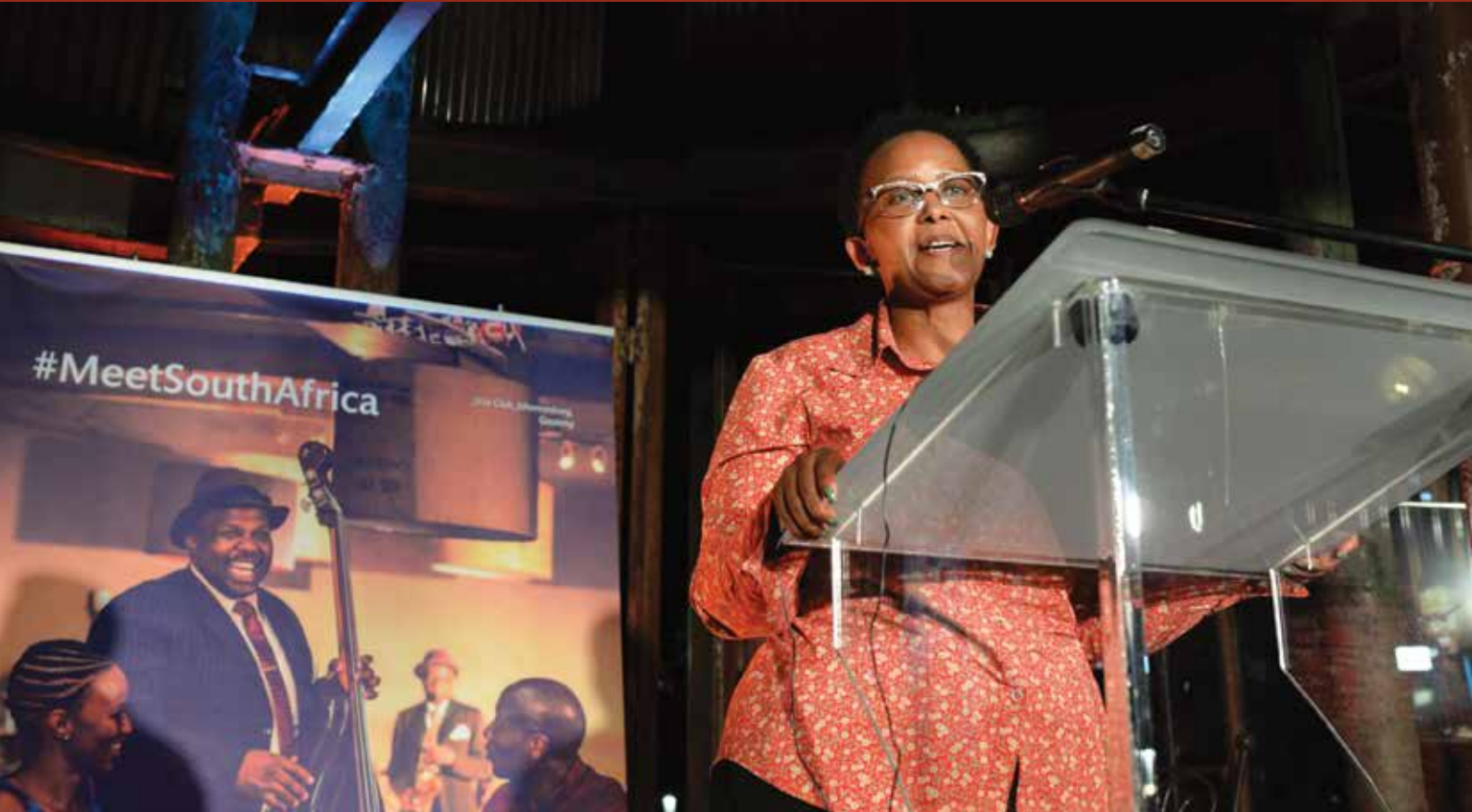
Deputy Minister of Tourism, Tokozile Xasa delivers a key note address during the Indaba SMME networking function

T he Deputy Minister of Tourism, Tokozile Xasa recognised the significant role played by Small, Medium and Micro- sized Enterprises (SMMEs) in the growth of the tourism sector especially in African countries.