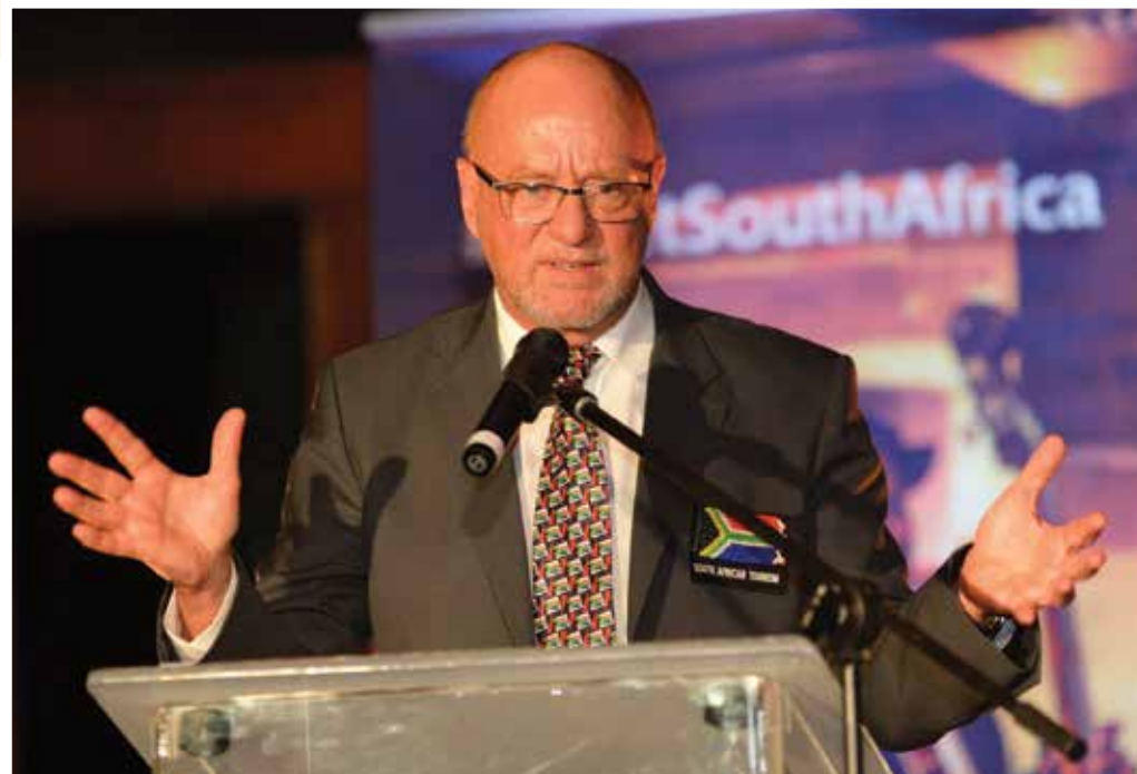
Minister of Tourism, Derek Hanekom

“The persistent surge in arrivals boded well for the potential of tourism to stimulate a range of economic activity and create jobs across the industry’s diverse value chain” - Tourism Minister Derek Hanekom