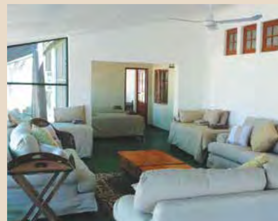
Mockford house living area verandah