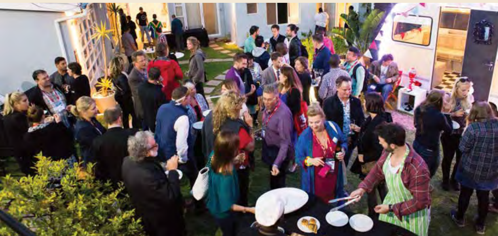
SAYTC members, partners, and other industry players came together for an unforgettable SAYTC party during WYSTC 2015, which was held in Cape Town in September. This leg of the evening was hosted by Atlantic Point Backpackers, Green Point, Cape Town

www.saytc.co.za www.travelnownow.co.za □