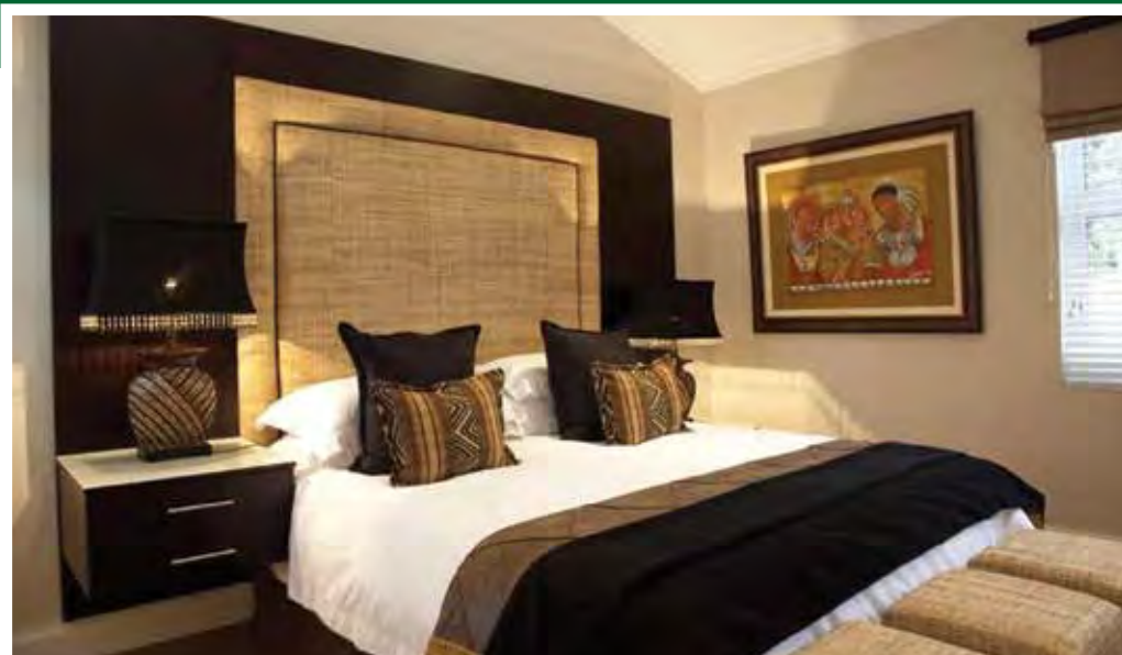
Some of the beautiful accommodation offered by the National Accommodation Association of South Africa (NAASA)

In 2002 this representation grew to 8 provinces, with 48 member associations and over 1,200 members. Over the last 5 years, membership has averaged around 1,000 establishments representing just under 9,000 rooms and some 4,500 full time employees a year. This provides us with a reasonable baseline of supportive members