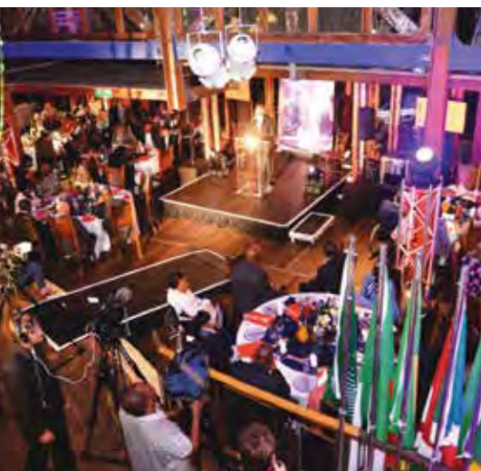
View from the top: Some of the exhibitions during the Tourims Indaba in Durban

Countries committed to further engage their respective governments as a way forward. Minister Hanekom cautioned against nontangible initiatives but rather suggested workshops Ministerial workshops that would also include academia and business to explore ideas in a think tank fashion to provide solutions in addressing African tourism issues. □