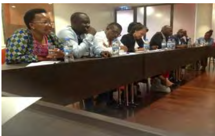
Minister Xasa participating in the Council of Ministers