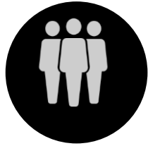
TRIPS / ARRIVALS