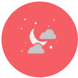
LENGTH OF STAY